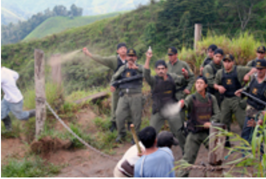
Paramilitary assault on the community of Junin, December 2006