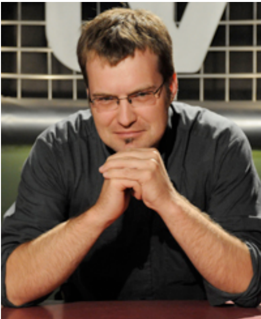
Director Photo (hi-res jpg included in press kit)

Produced and directed by Malcolm Rogge. Under Rich Earth © Rye Cinema 2008