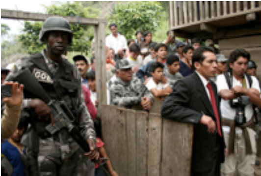
Government officials arrive in the tiny village of Junin, December 2006

A hi-res jpg is included in the press kit